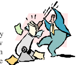
Board minutes used for defence

Please come and talk through any planned changes in these areas before taking action.